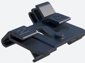
1008067 ClickFit EVO MLPE Clip Light Weight

MLPE stands for Module-Level Power Electronics, which includes optimizers and microinverters. With the new MLPE clips all optimizers, microinverters and cables can be attached correctly and safely attached to the frame.